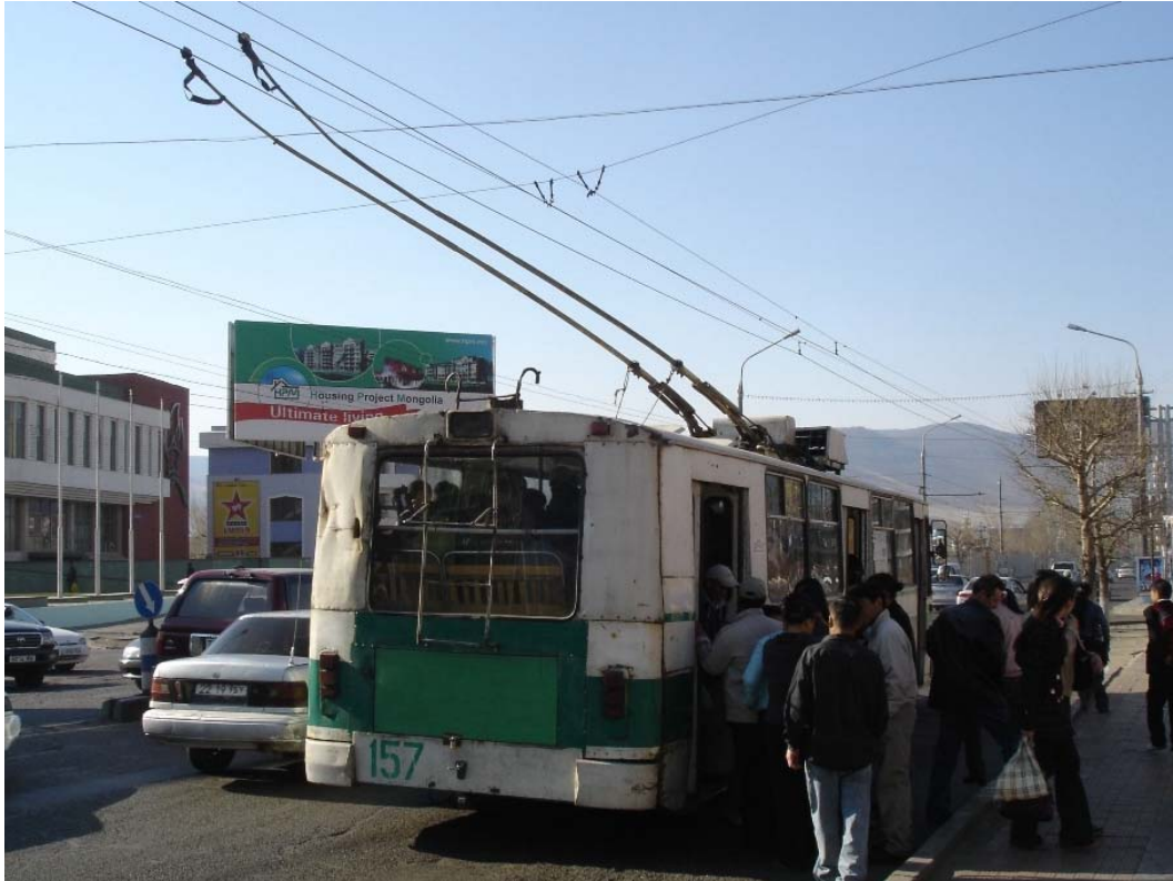
The bus stop opposite the Hotel Bayangol Chinggis Avenue, 9:15 04.05.2007