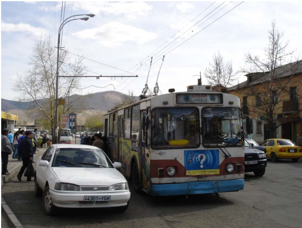
The bus stop on Seoul str., 14:12, 12.05.2007