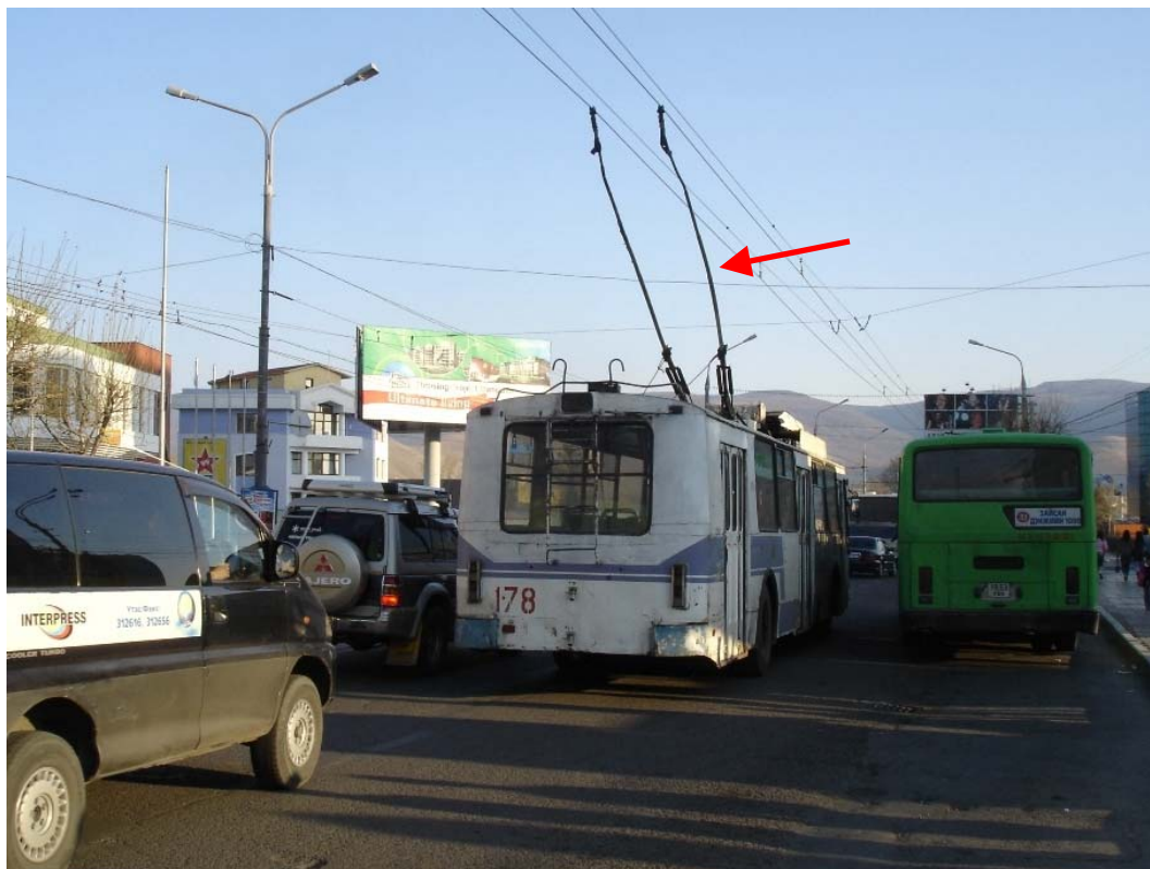
Chinggis Avenue, 9:05 05.05.2007