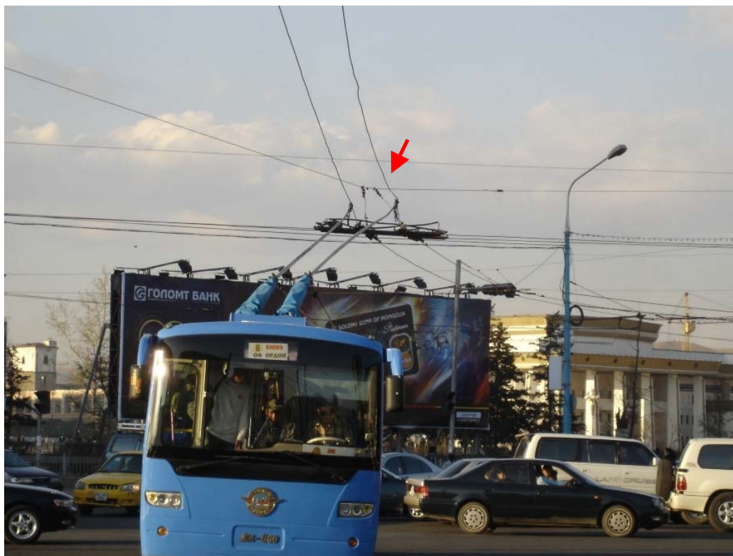
At the same time he supports the contact system on the corner of Enkhtaiwan Avenue and Chinggis Avenue