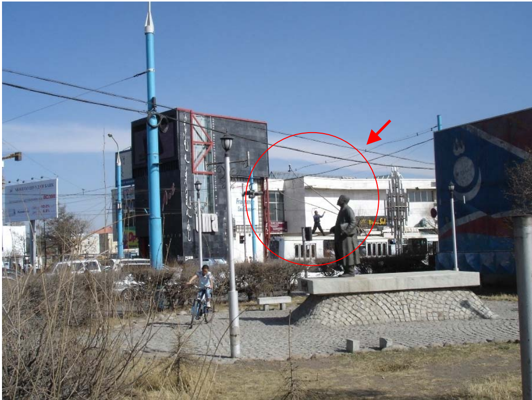
Enkhtaiwan Avenue, 9:15 05.05.2007