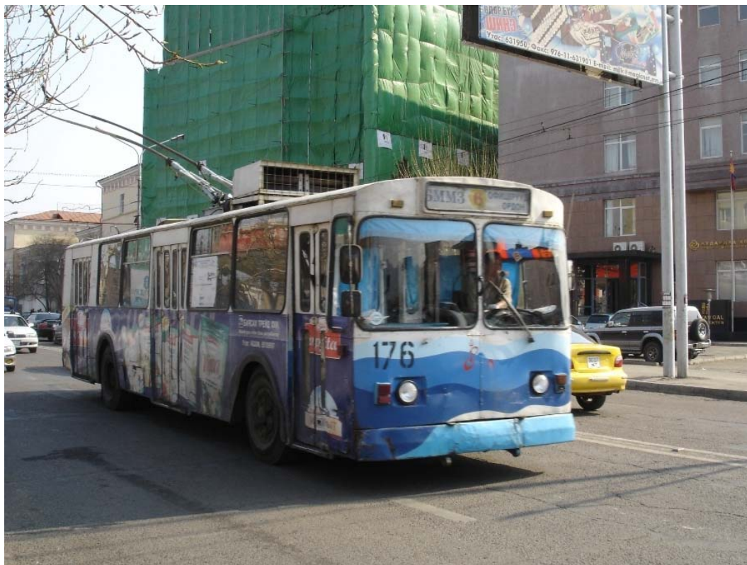
The same trolleybus nearer, Model ZIU Chinggis Avenue, 8:25 02.05.2007