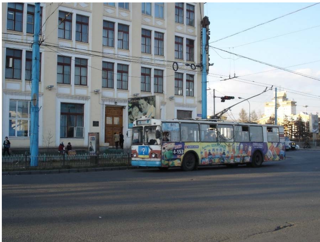
Perhaps the same lively trolleybus on Enkhtaiwan Avenue, 9:25, 14.05.2007