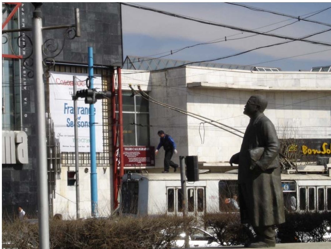
Enkhtaiwan Avenue, 9:15 05.05.2007